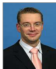
Stefan Wallin Minister of Culture and Sport Ministry of Education and Culture, Finland